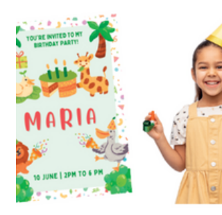
INVITE When you ask

When you think that something or someone is very nice to look at. you think they are BEAUTIFUL.